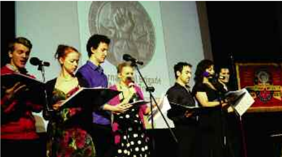
SINGING: The cast of "Goodbye Barcelona" perform at the IBMT's lecture day at London's Imperial War Museum on 5 March. See report on page 4.