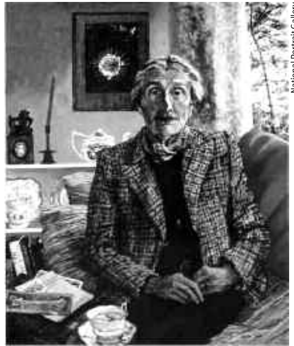
National Portrait Gallery