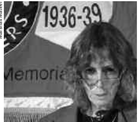
PALFREEMAN: Achievements of medics in Spain.