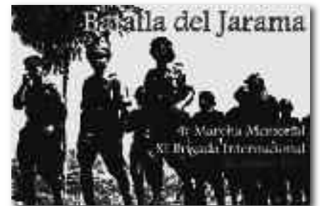
The poster for this year’s event.

At a ceremony of remembrance at the International Brigade memorial overlooking