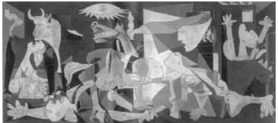
Picasso’s Guernica was exhibited in London in 1939. Information about the event is now being sought. See the first letter.