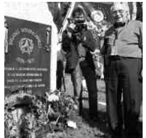
Above: IBMT Life President Jack Jones at the memorial to the International Brigades at Montjuich, Barcelona.