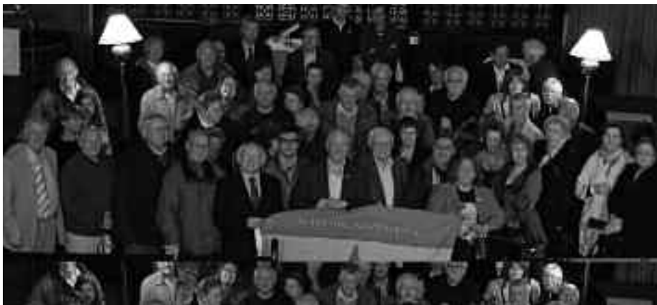
FOR GEORGE BROWN: Participants at the fourth annual George Brown Commemoration Weekend at Inistioge, Co Kilkenny, on 24/25 June included (from left, holding flag) Labour Party presidential candidate Michael D Higgins, Unite Ireland