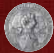
International Brigade Memorial Trust

In association with Unite the Union Organised by Philosophy Football