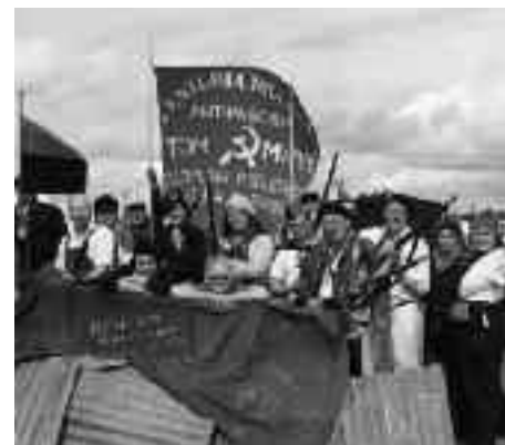
WHERE'S THE ENEMY? To mark the 75th anniversary of the start of the Spanish Civil War, members of the La Columna Spanish Civil War re-enactment group staged a depiction of the arrival of volunteers in Barcelona at the English Heritage Festival of History at Kelmarsh Hall, Northamptonshire on 16/17 July.