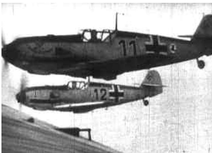
Two Messerschmitt 109s over Britain, one with crossed daggers and “Arriba el Campo” slogan.

In fact the DVD showed the aircraft to be facto-