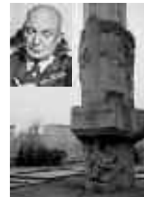
Poznan's memorial to General Walter (inset).