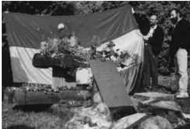
Unveiling in 1996 of a memorial to International Brigade and Republican prisoners held at San Pedro de Cardeña, near Burgos, in 1996. See "San Pedro de Cardeña" below.