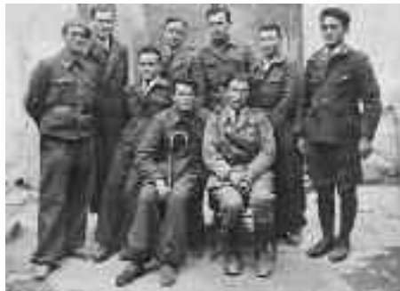
Jewish volunteers in "Madrid Before Hanita".

The volunteers from Palestine also faced criticism for their beliefs in equality and coexistence with the Arab population. In addition, they were not supported by the leadership of the Commu-